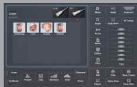
Intuitive Graphic Icon Guides operators into the exam mode with a single touch

Using S9, you will get faster operation on a variety of applications, including the most difficult diagnostic tasks. View these programs below, and be inspired to boost your productivity.