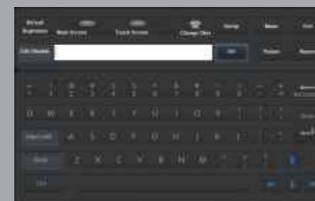
Virtual Alphabet Keyboard Ensure patient information and doctor comments to be input in the easiest way