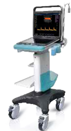
Stylish Trolley with Adjustable Height