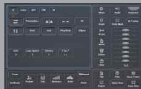
Convenient Adjustment All parameters can be adjusted easily by pressing the smart touch screen