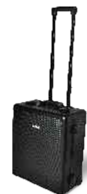
Sturdy Suitcase in Low-pitched Luxurious Style