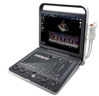
50° Foldable 15" LCD Display Graphical User Interface Touch Screen

SonoScape's S9 offers the highest standard of ergonomics and delivers you the latest technological innovations with highly-integrated chip sets, which enables excellent portability and flexibility. Incorporated an intelligent and style-changeable smart touch screen, S9 has set a new standard for ultrasound scanning, which will bring you unprecedented ease-of-use.