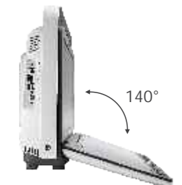
140° Opening Angle Abundant Connection Interface