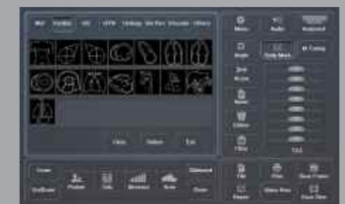
Specific Application Packages Measurement items, body marks and annotations are classified in terms of different applications