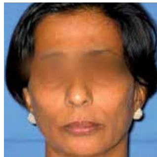
SKIN REJUVENATION