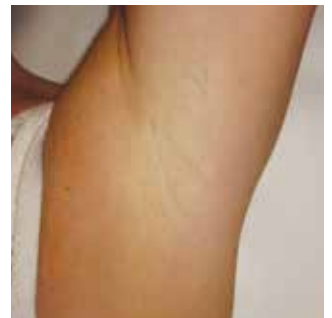
PERMANENT HAIR REDUCTION