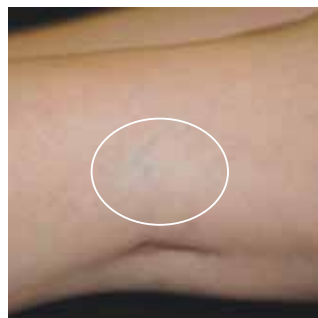
VASCULAR LESIONS LEGS