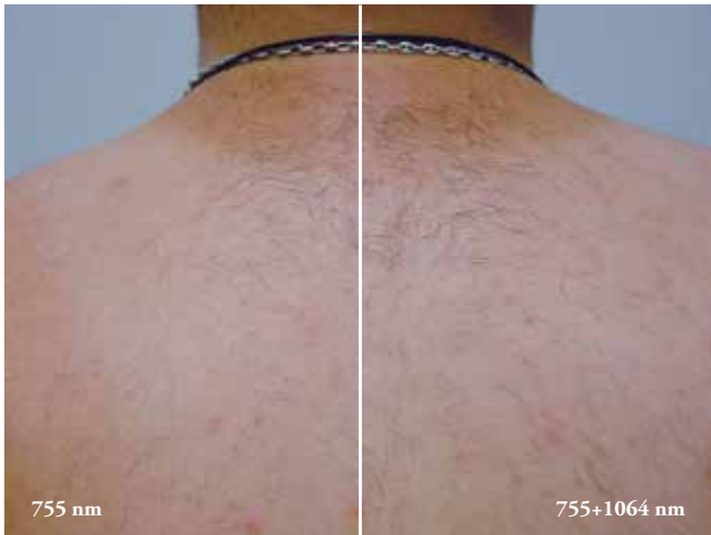
COMPARATIVE PERMANENT HAIR REDUCTION 755 nm - 755+1064 nm