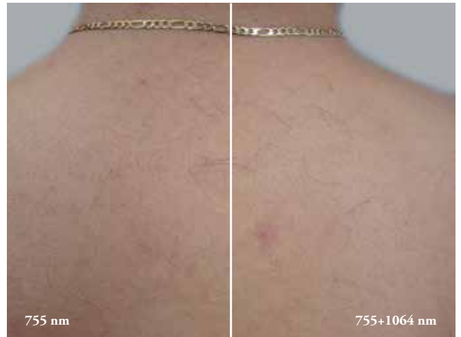
COMPARATIVE PERMANENT HAIR REDUCTION 755 nm - 755+1064 nm Post 2 treatments, follow-up 4 months